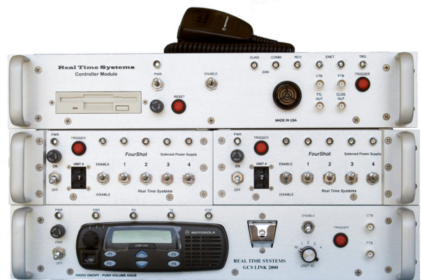
From top to bottom: LongShot, FourShot Power Supply, GCS Link